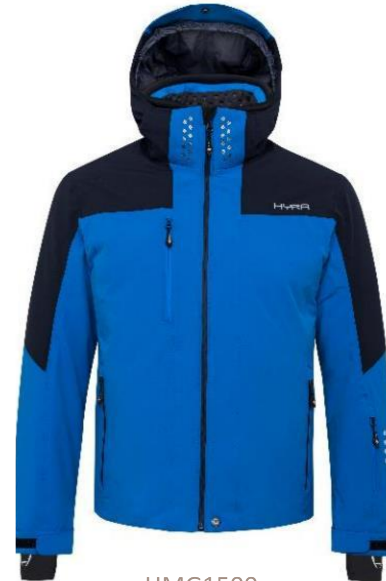
HMG1500 348-BLUE /LEAD BLUE/WHITE