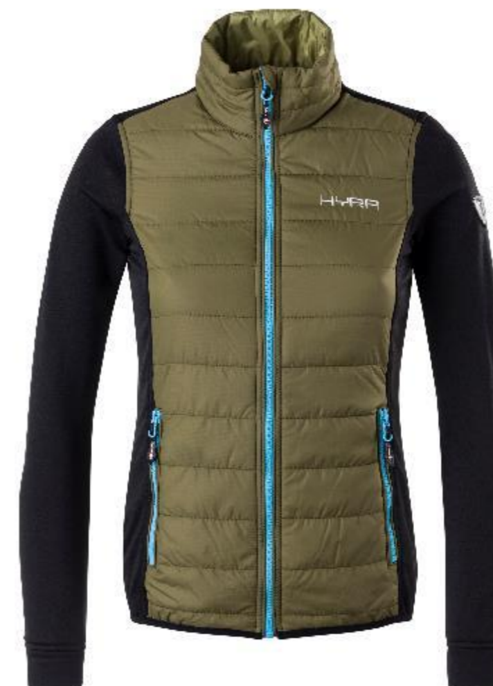
HLG2660 194-ARMY GREEN/BLACK