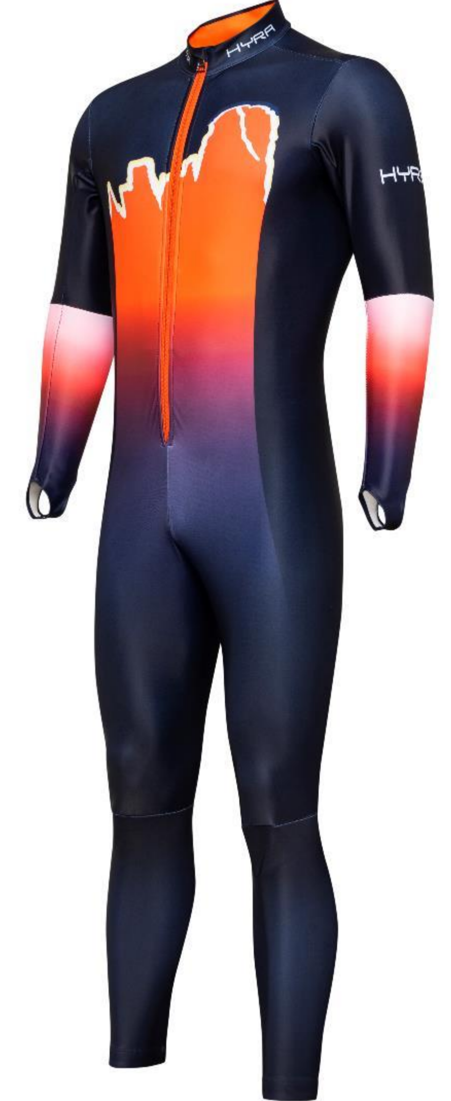
HMR1581 – HJR1585 322-SHOCKING ORANGE/LEAD BLUE/WHITE