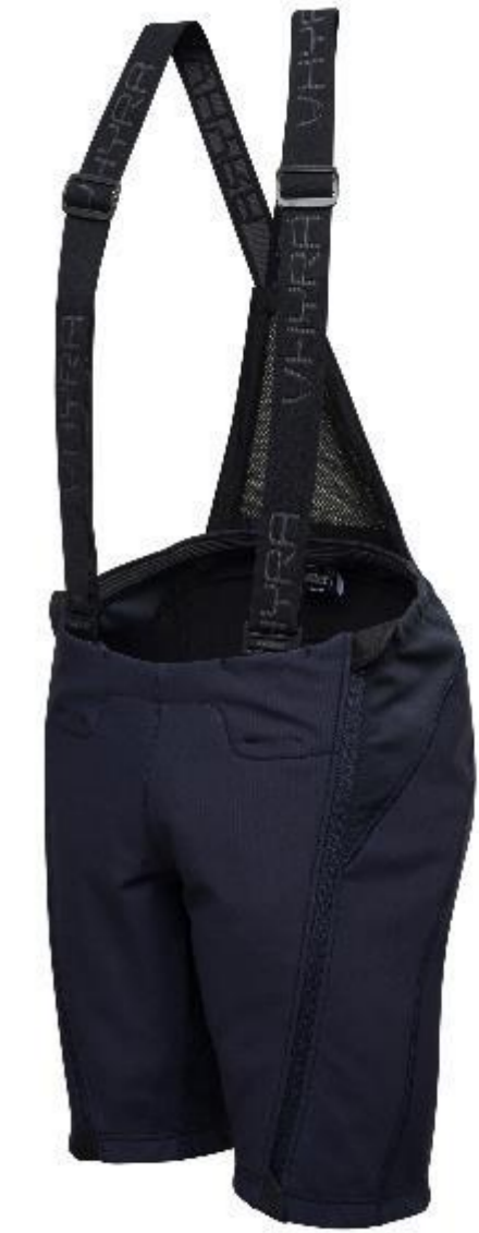
HMP1511 212-LEAD BLUE