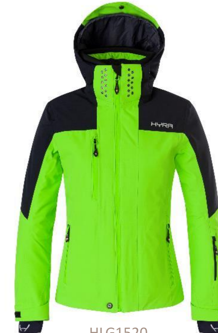
HLG1520 276-GREEN GEKO/LEAD BLUE/WHITE