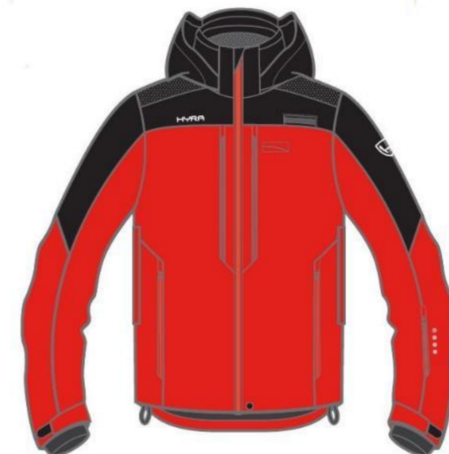
HMG1503 206-RED /BLACK