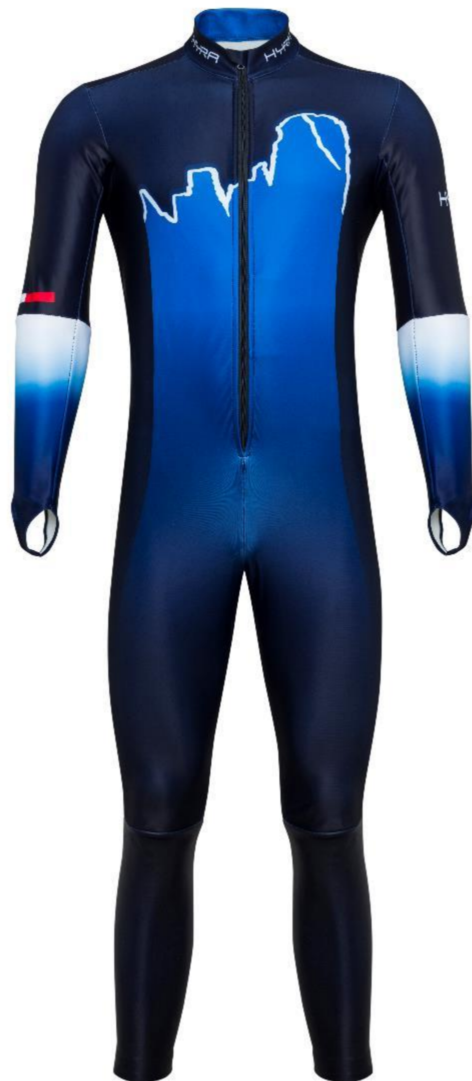
HMR1581 – HJR1585 348-BLUE/LEAD BLUE/WHITE

Developed for race teams and competitive athlete