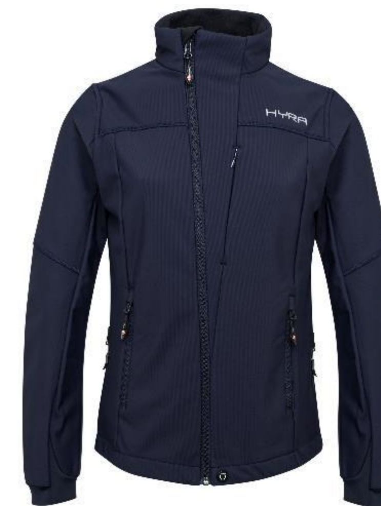
HLG1525 212-LEAD BLUE