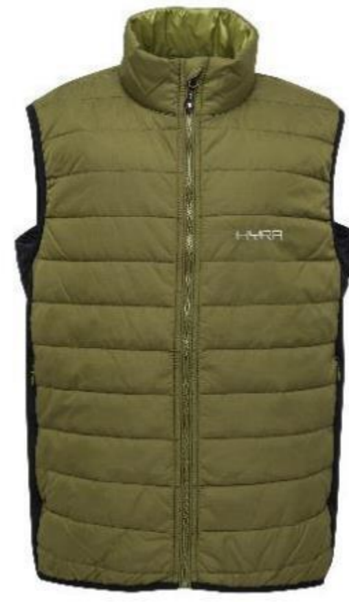
HJG2680 173-ARMY GREEN