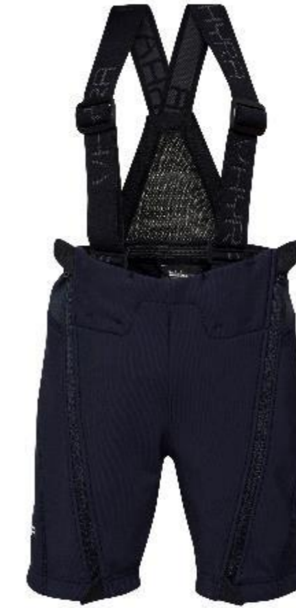
HJP1561 212-LEAD BLUE