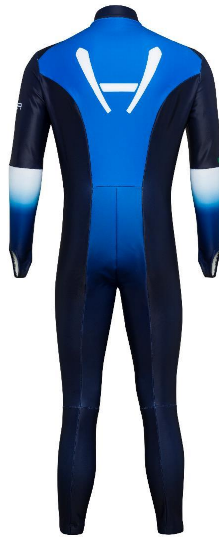
HMR1581 – HJR1585 348-BLUE/LEAD BLUE/WHITE