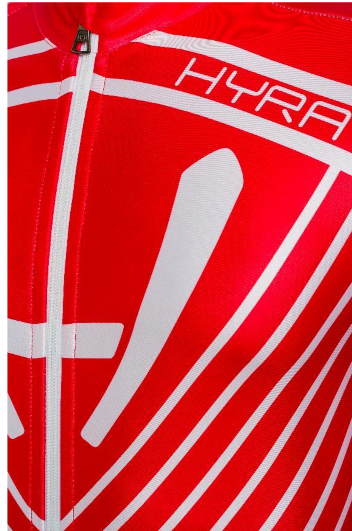
HMR1582 RACE SUIT FIS BIELASTIC