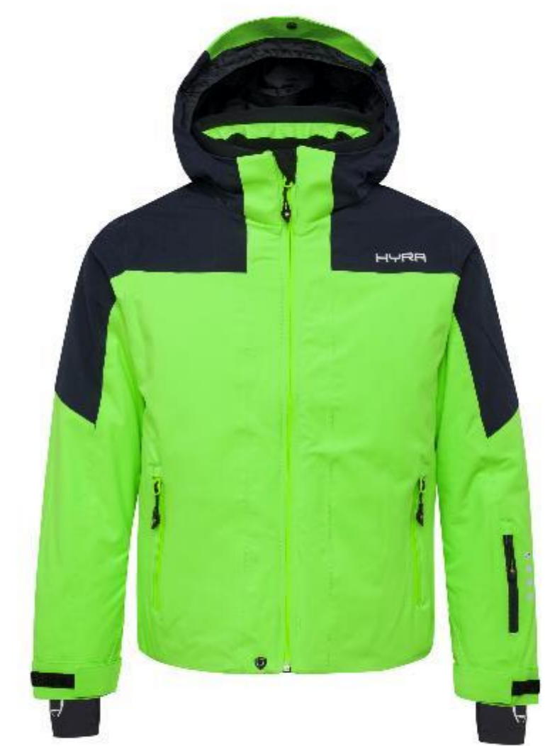
HJG1550 276-GREEN GEKO/LEAD BLUE/WHITE