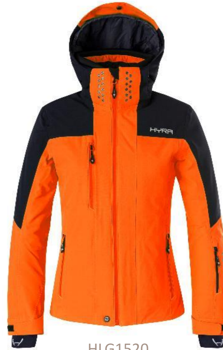
HLG1520 322-SHOCKING ORANGE/LEAD BLUE/WHITE

Removable and adjustable hood, Soft chin protector, Ergonomic sleeves Hyra cuff tightening system, Adjustable hem drawstring (inside pocket access), Interior powder skirt with DWR treatment, Laser-cut neck detail with metal mesh insert, 3D rubberized prints, External pockets, Internal mesh pockets, Polybrushed handwarmer pockets, Integrated goggle wiper Every element is designed for precision, durability and race-level functionality.