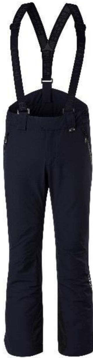
HMP1510 212-LEAD BLUE

Durable Water Repellent (DWR) treatment on back area Inner snow gaiter at leg bottom with gripper elastic and Velcro Ballistic fabric reinforcement at leg hem Functional side pockets Back pocket (Men) Full operational accessibility thanks to full-length waterproof zips