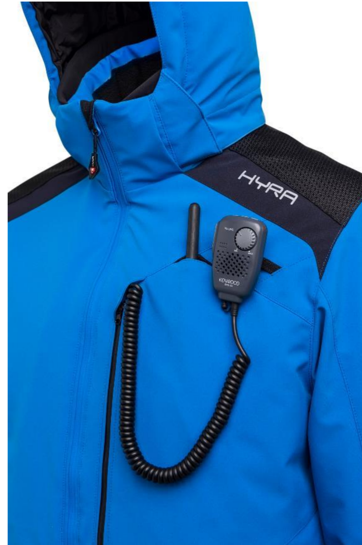
HMG1501 FRONT DETAIL CLOSED POCKET