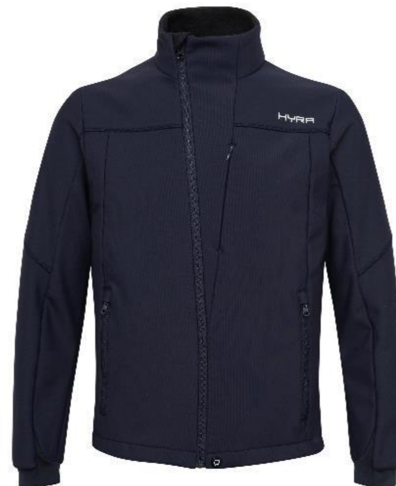
HMG1505 212-LEAD BLUE