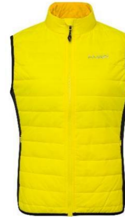
HLG2651 124-BLAZING YELLOW