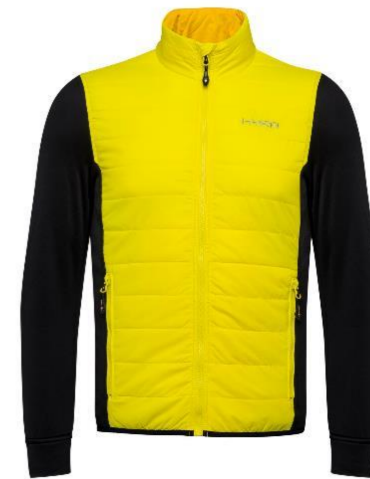
HMG2610 131-BLAZING YELLOW/BLACK