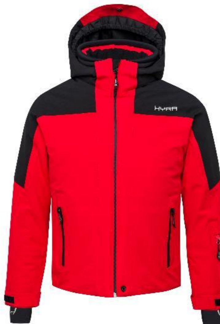
HJG1550 401-HEAT RED/BLACK