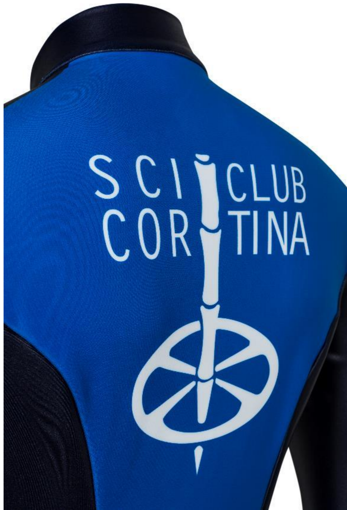
HMR1581 RACE SUIT/GAUZED SUIT BIELASTIC