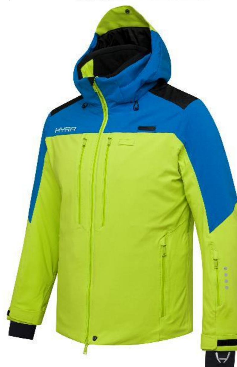
HMG1503 224-GREEN GRAPE/BLUE/BLACK