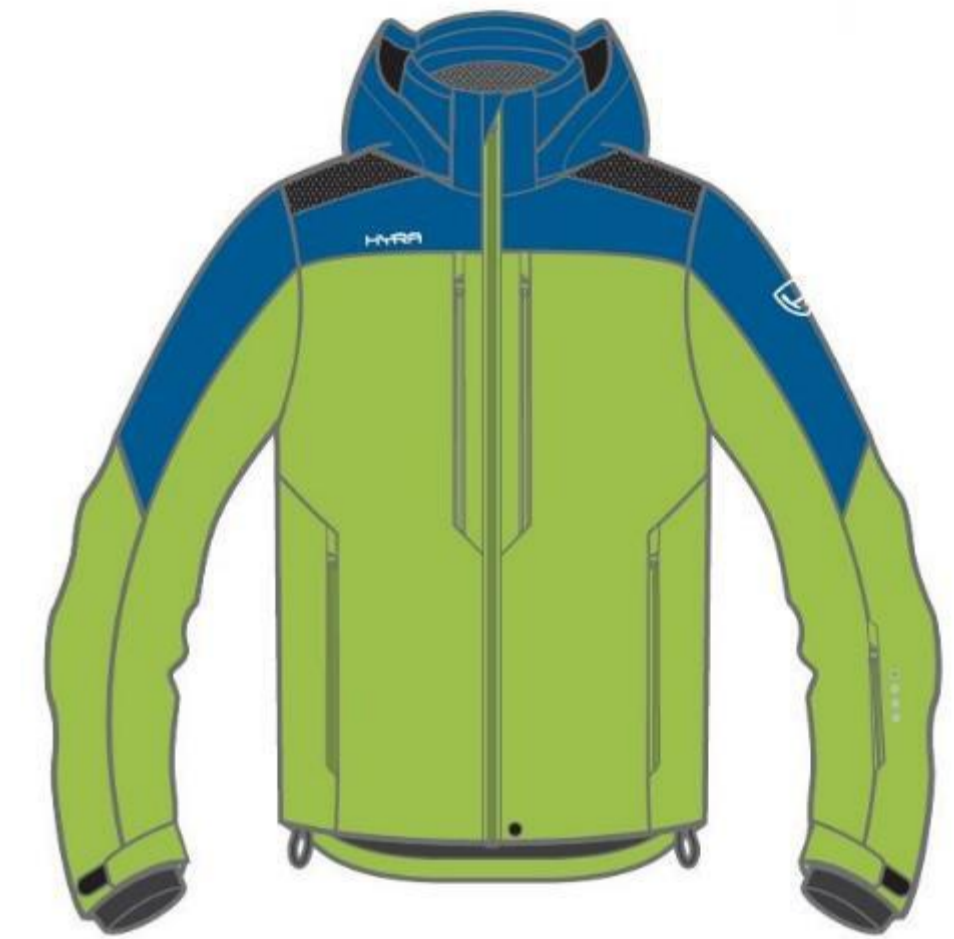
HJG1553 224-GREEN GRAPE/BLUE/BLACK