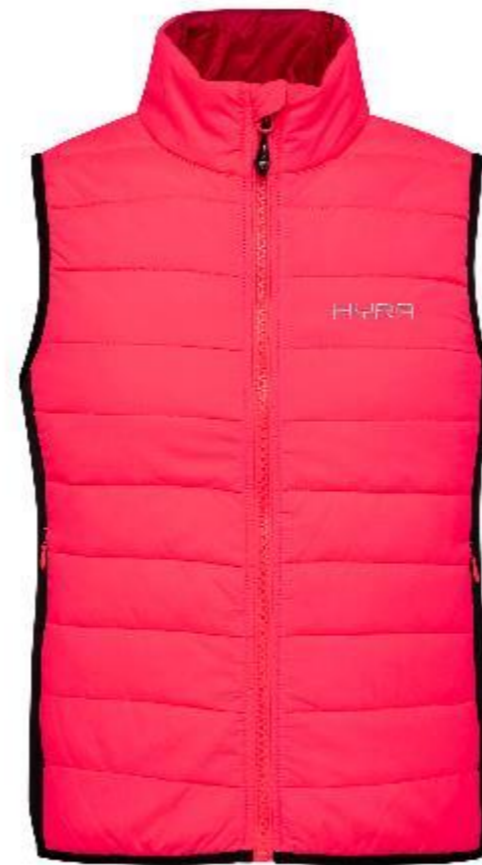
HJG2680 333-BRIGHT PINK