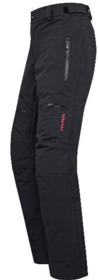
HMP1542 OVERALL PROFILE