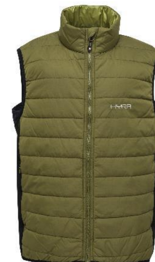
HMG2601 173-ARMY GREEN