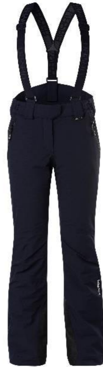
HLP1530 212-LEAD BLUE

Feminine fit Durable Water Repellent (DWR) treatment on back area Inner snow gaiter at leg bottom with gripper elastic and Velcro Ballistic fabric reinforcement at leg hem Functional side pockets Back pocket (Men) Full operational accessibility thanks to full-length waterproof zips