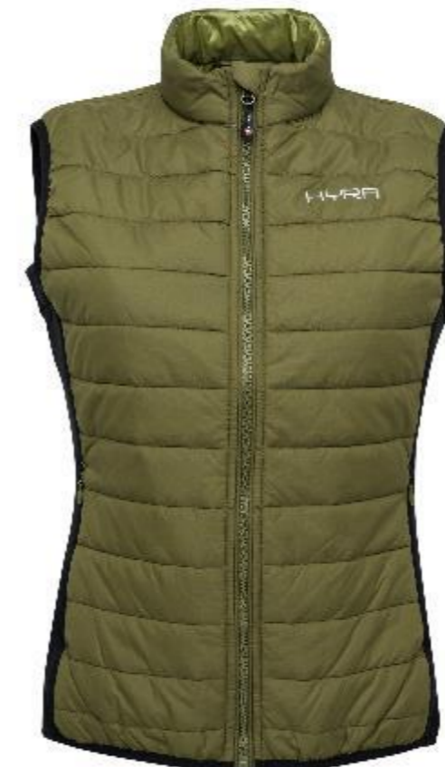
HLG2651 173-ARMY GREEN