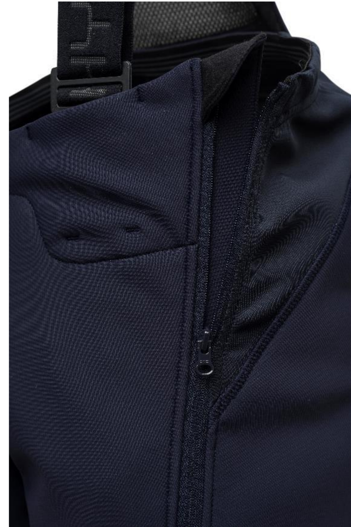
HMP1511 FULL ZIP OPENING UPPER PART