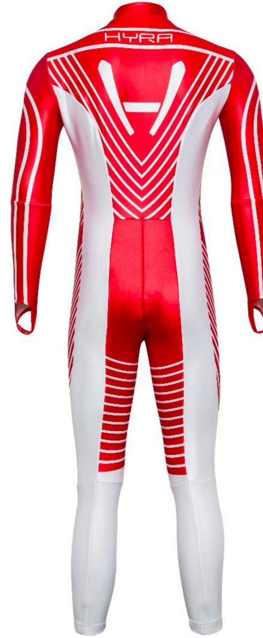
HMR1582 – HJR1586 17-RED