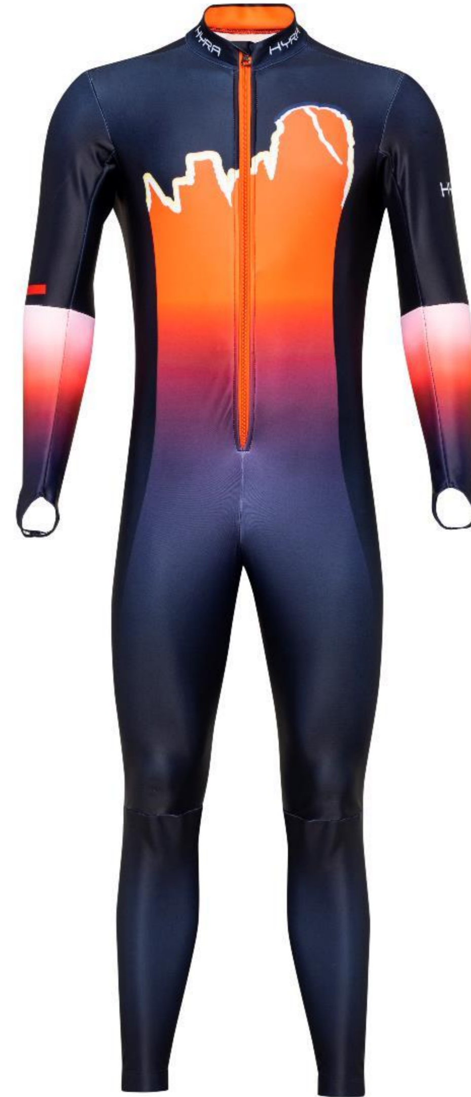
HMR1581 – HJR1585 322-SHOCKING ORANGE/LEAD BLUE/WHITE

Developed for race teams and competitive athlete