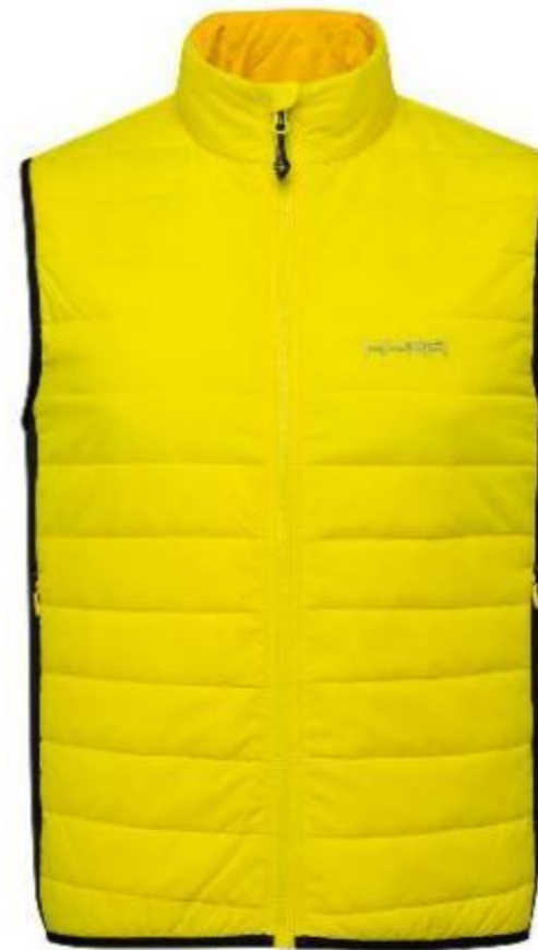
HMG2601 124-BLAZING YELLOW

Lightweight and comfortable structure Technical thermal layer for ski performance External functional pockets