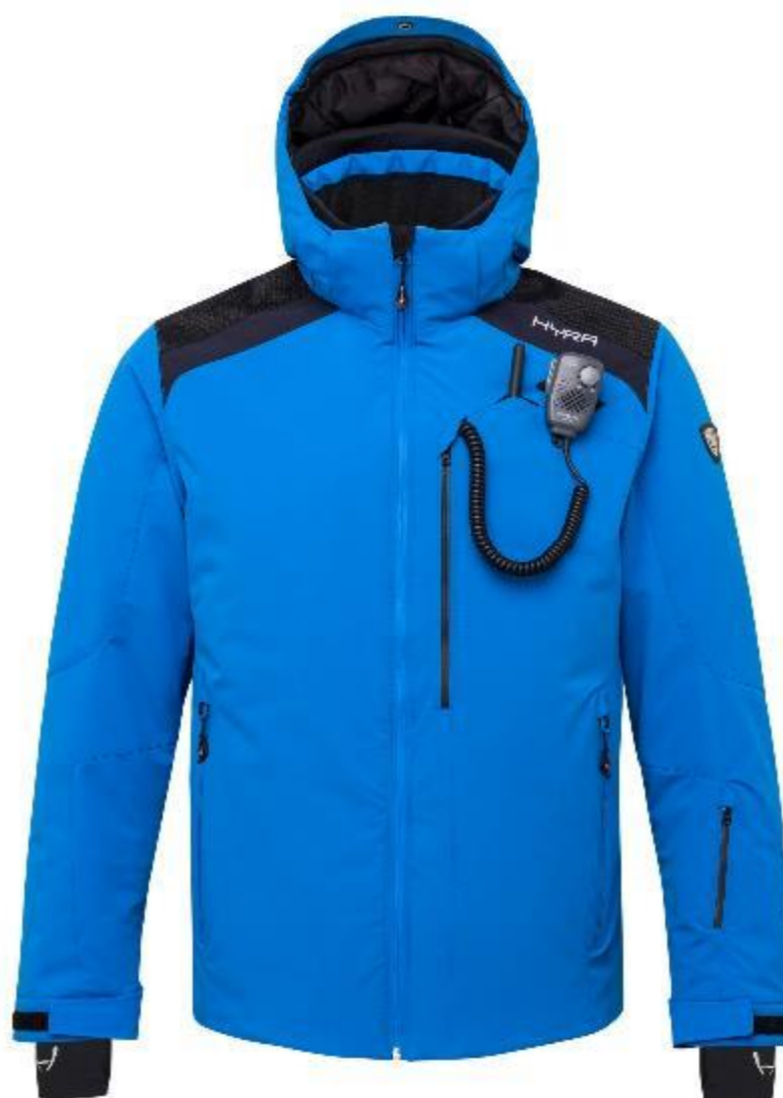
HMG1501 348-BLUE/LEAD BLUE/WHITE

Removable and adjustable hood Soft chin protector Ergonomic sleeves, Hyra cuff tightening system Interior powder skirt with DWR treatment Ultra-breathable membrane Hyra signature prints Every detail is engineered to support performance, durability and professional reliability on the mountain.