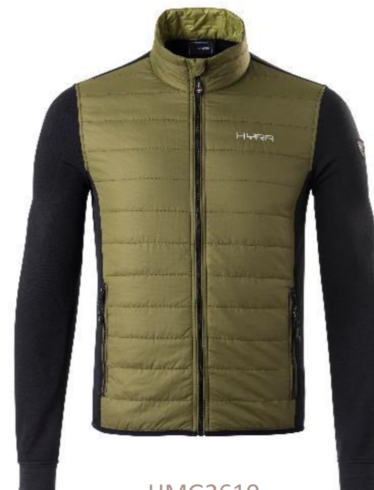
HMG2610 194-ARMY GREEN/BLACK