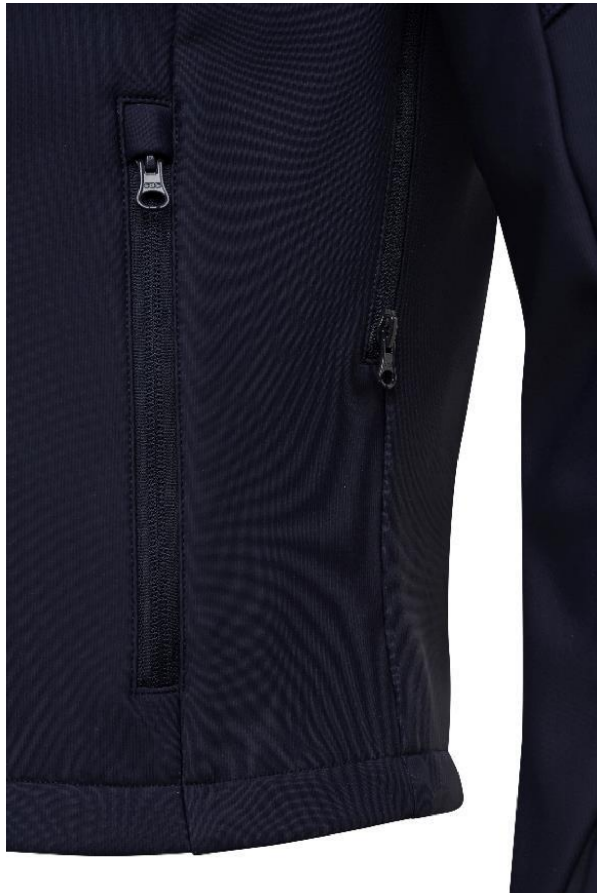
HMG1505 HANDY AND FUNCTIONAL DETAIL