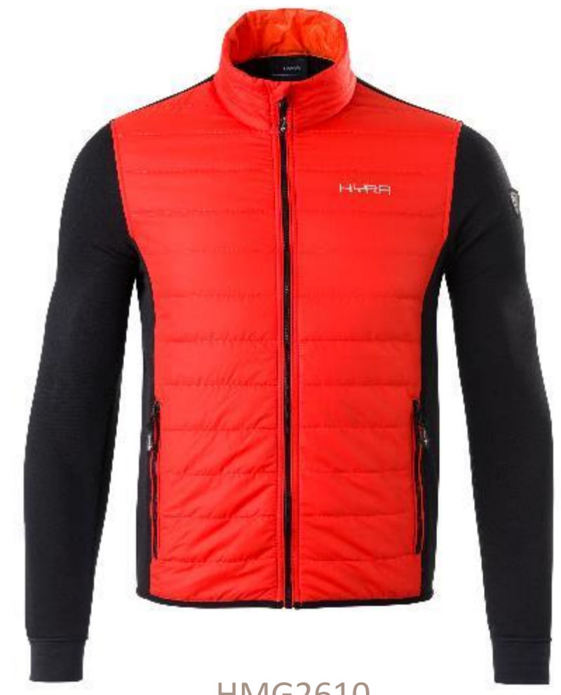
HMG2610 401-HEAT RED/BLACK