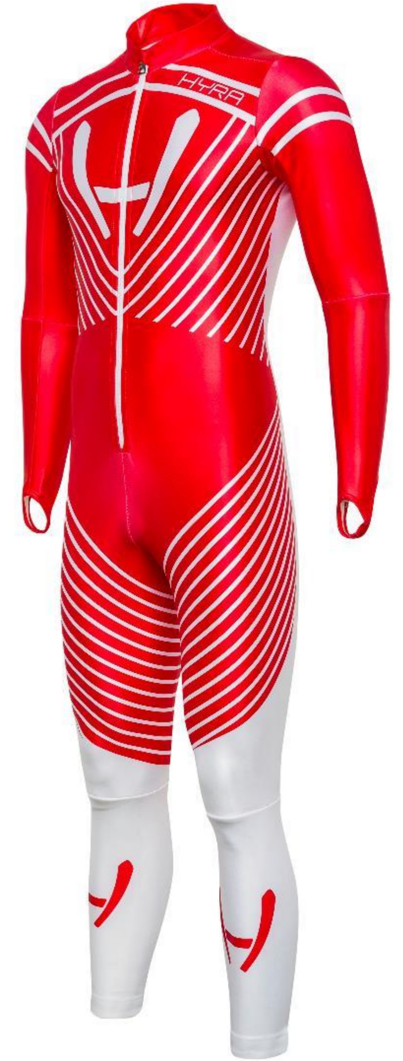
HMR1582 – HJR1586 17-RED