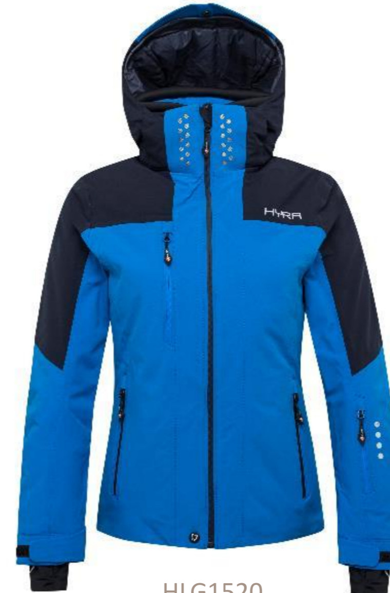
HLG1520 348-BLUE /LEAD BLUE/WHITE