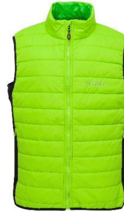
HJG2680 305-LIME GREEN