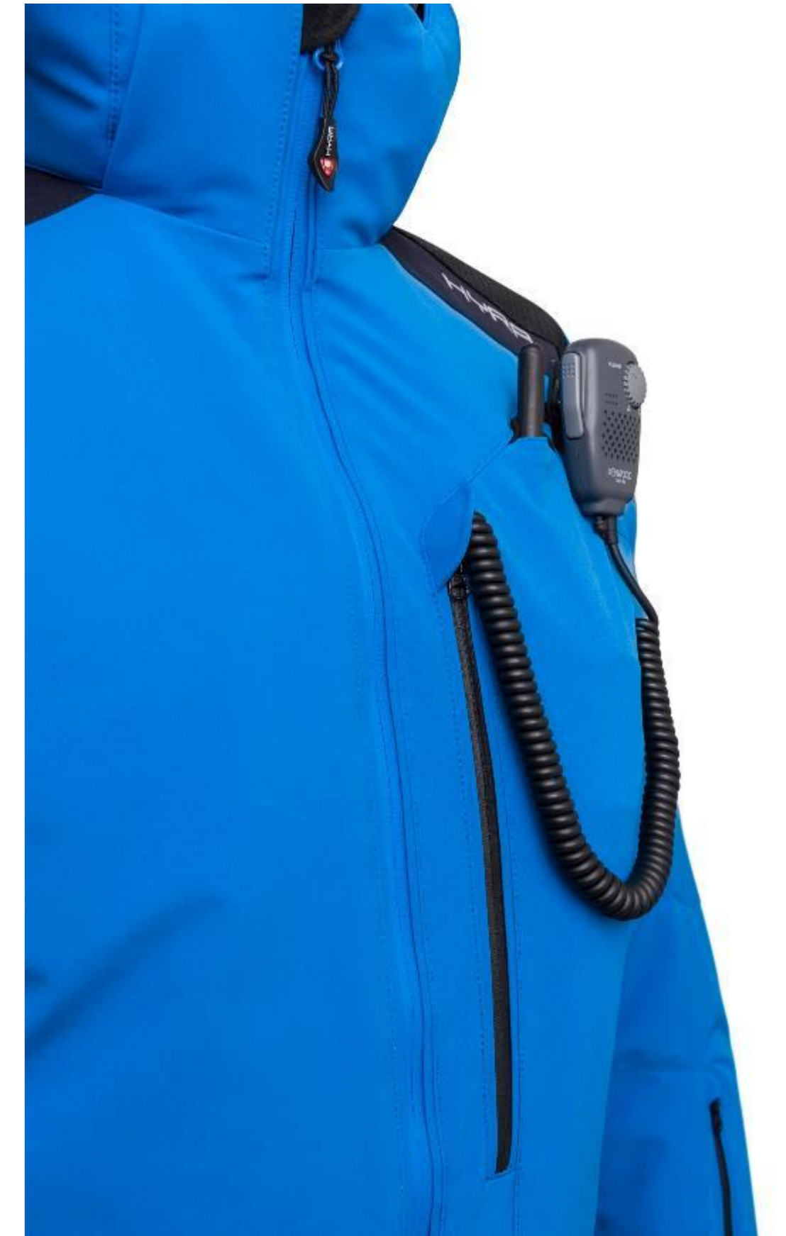
HMG1501 SIDE DETAIL CLOSED POCKET