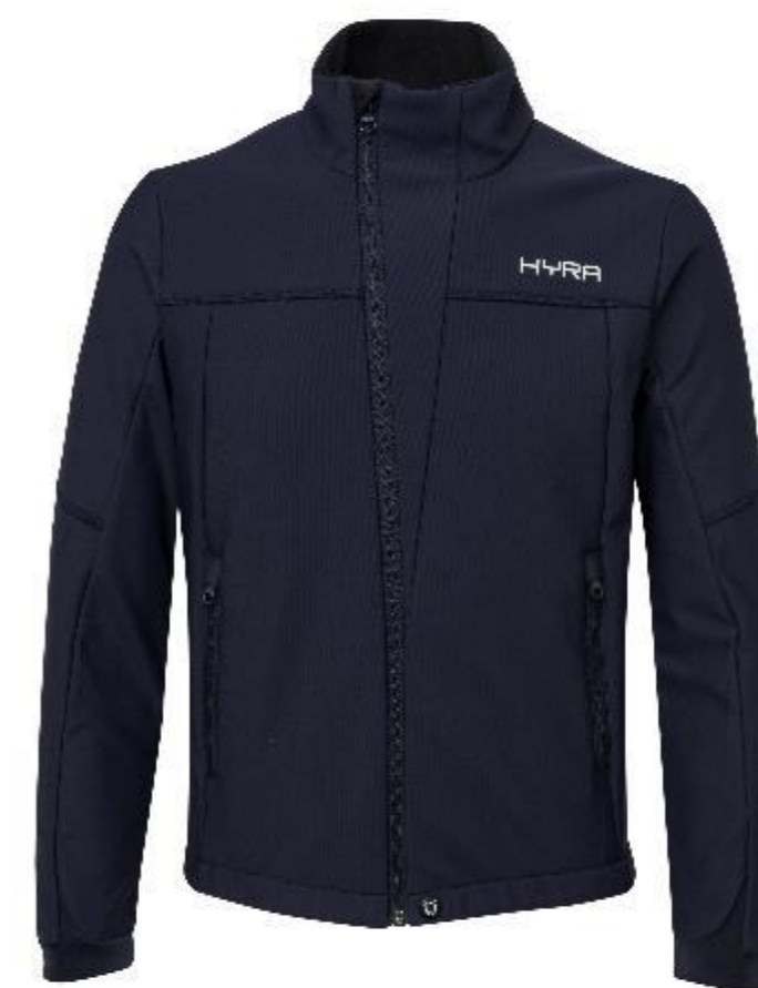
HJG1555 212-LEAD BLUE