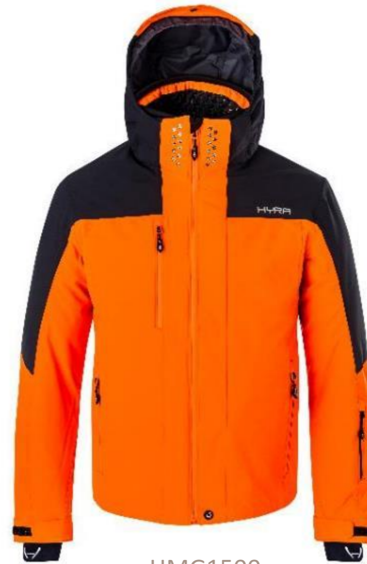
HMG1500 322-SHOCKING ORANGE/LEAD BLUE/WHITE

Removable and adjustable hood, Soft chin protector, Ergonomic sleeves Hyra cuff tightening system, Adjustable hem drawstring (inside pocket access), Interior powder skirt with DWR treatment, Laser-cut neck detail with metal mesh insert, 3D rubberized prints, External pockets, Internal mesh pockets, Polybrushed handwarmer pockets, Integrated goggle wiper Every element is designed for precision, durability and race-level functionality.