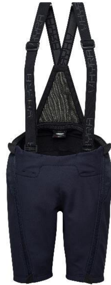
HMP1511 212-LEAD BLUE

Designed to ensure stability, secure fit and ventilation during high-intensity sessions.