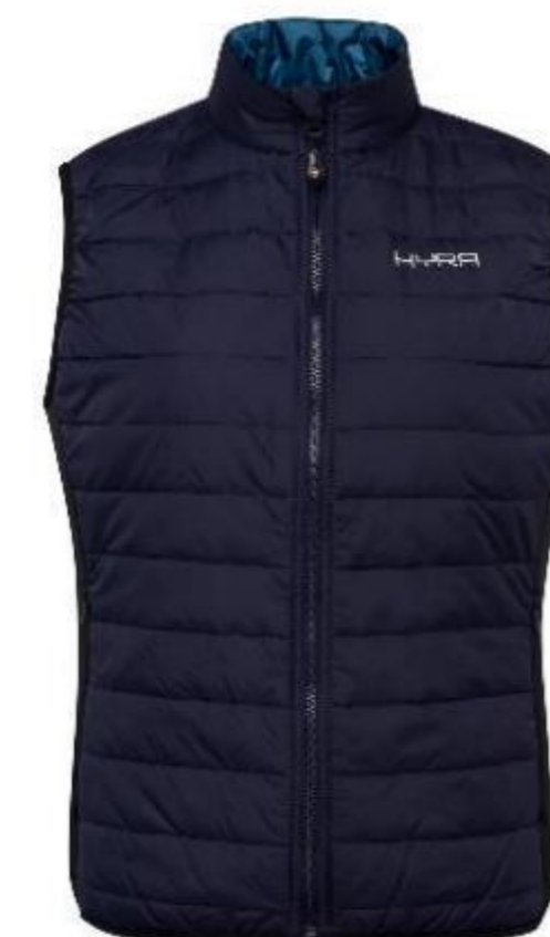
HLG2651 212-LEAD BLUE