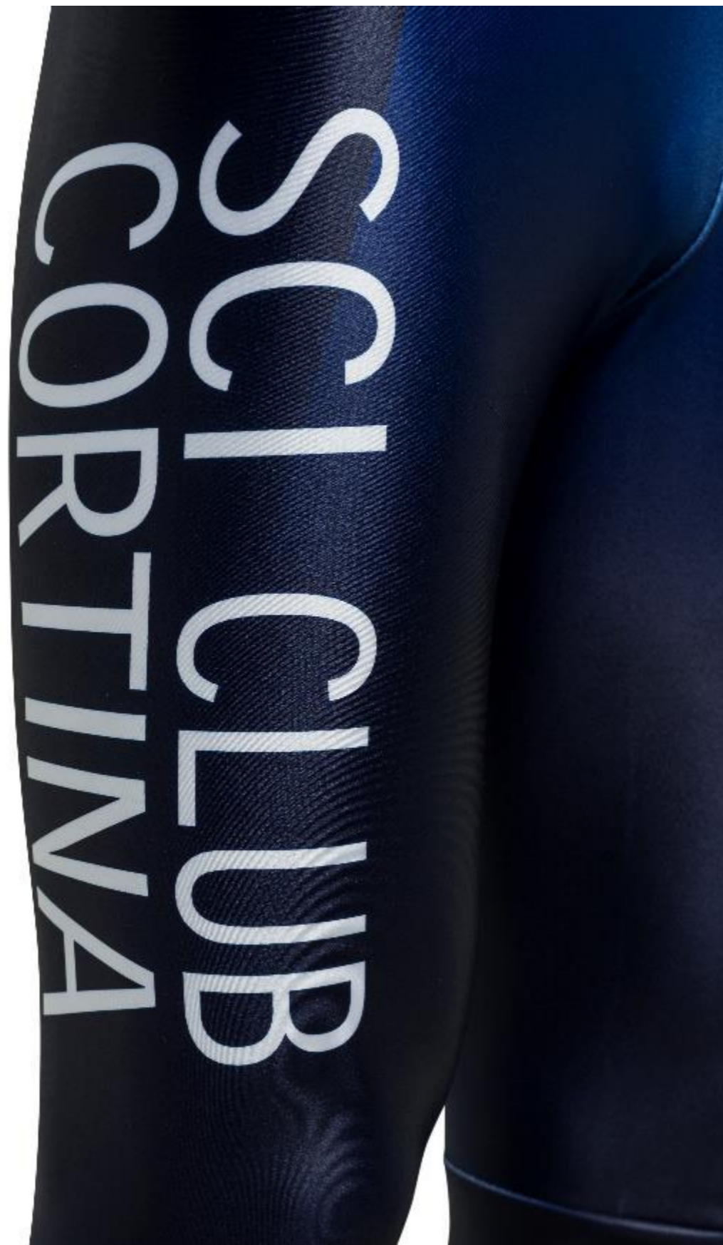
HMR1581 RACE SUIT/GAUZED SUIT BIELASTIC