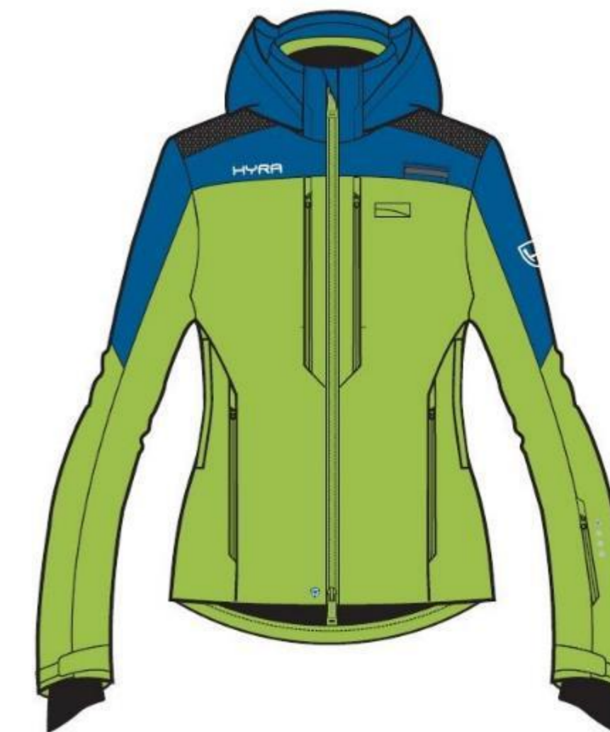
HLG1523 224-GREEN GRAPE/BLUE/BLACK