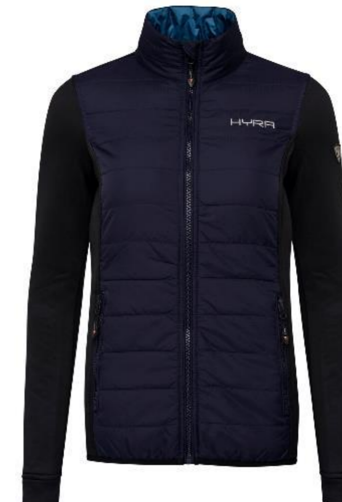
HLG2660 211-LEAD BLUE/BLACK