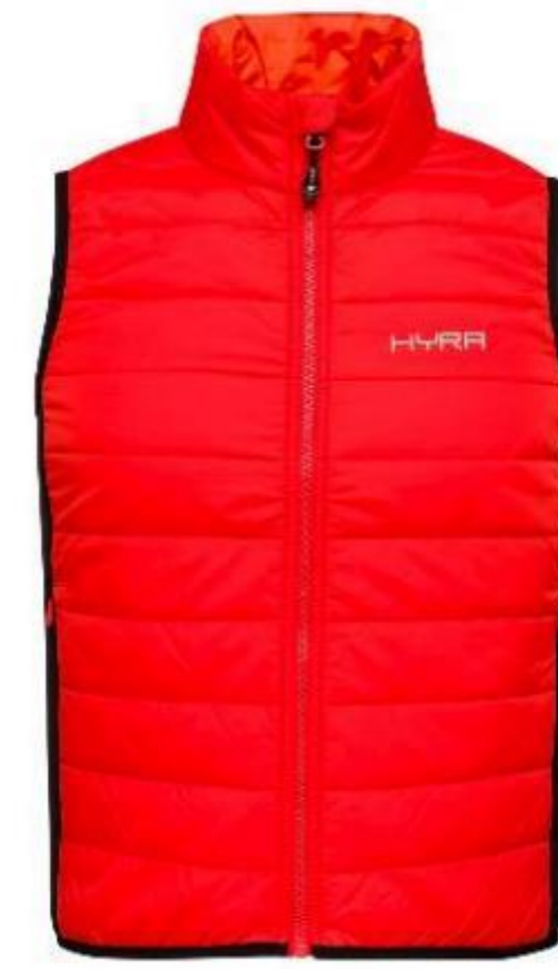
HJG2680 400-HEAT RED