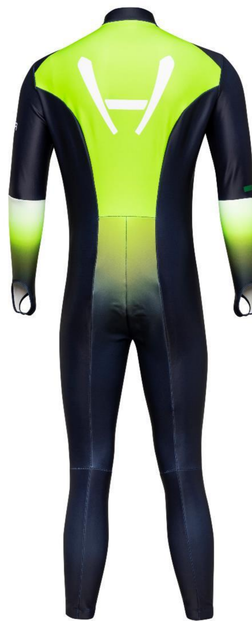
HMR1581 – HJR1585 276-GREEN GEKO/LEAD BLUE/WHITE