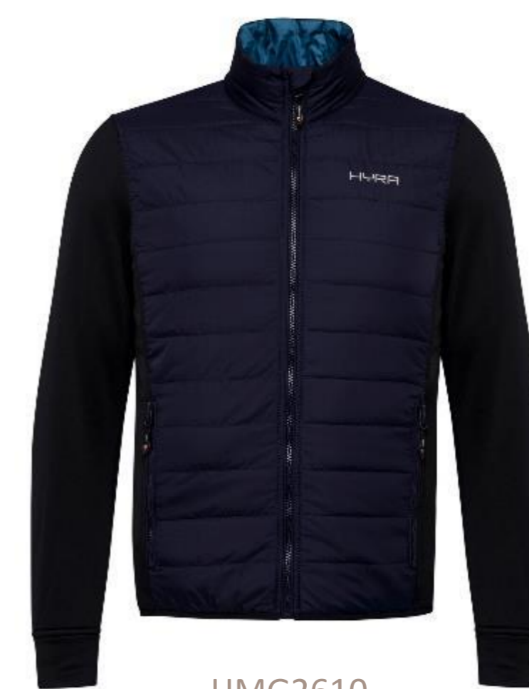
HMG2610 211-LEAD BLUE/BLACK