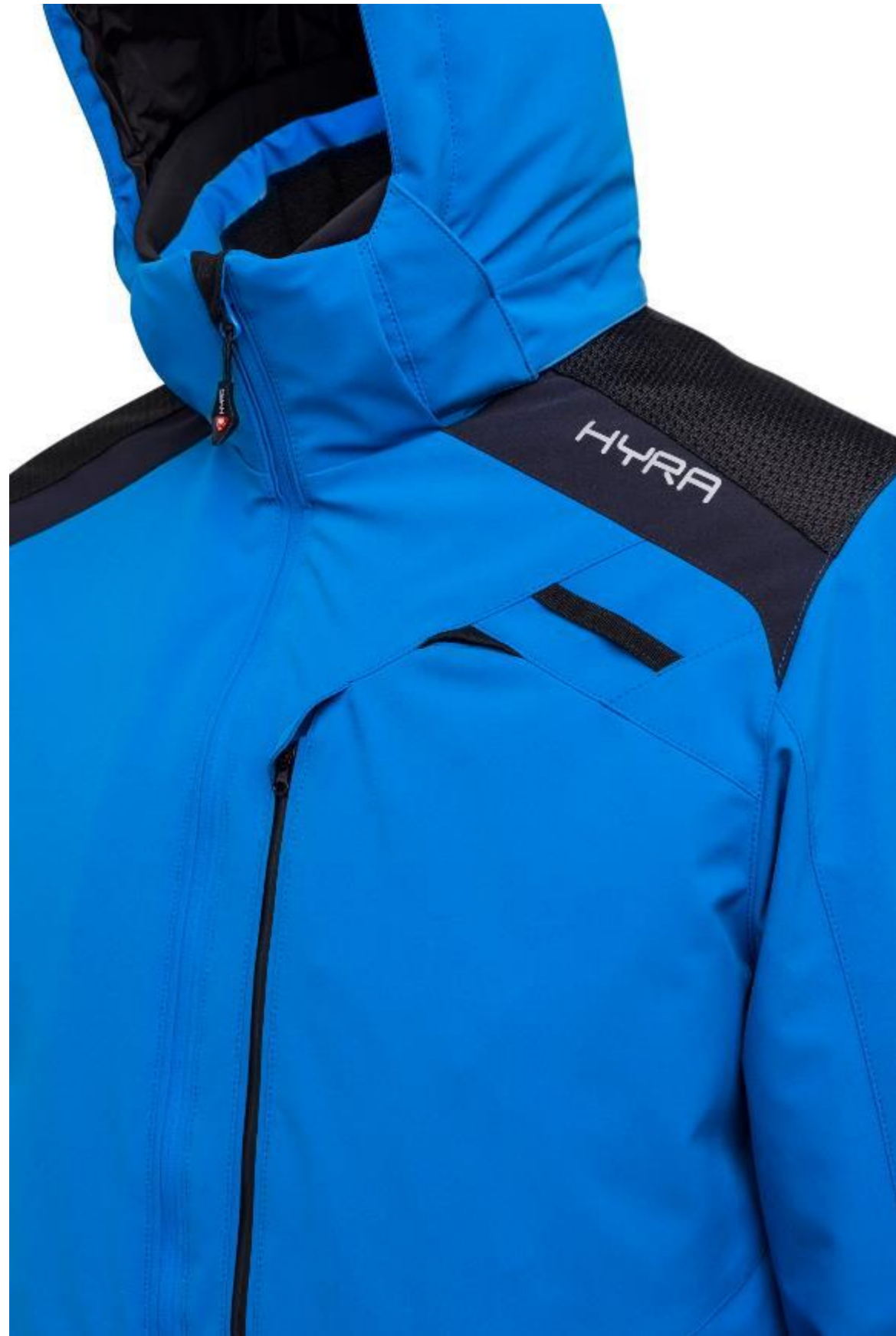
HMG1501 CLOSED DETAIL