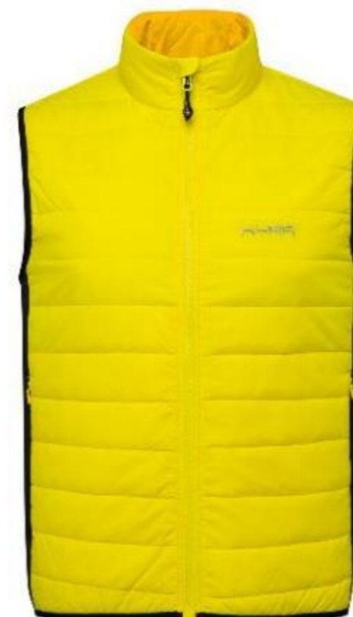
HJG2680 124-BLAZING YELLOW