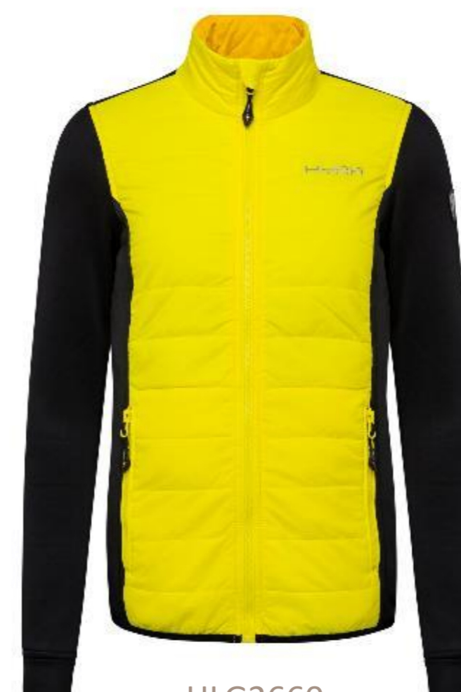
HLG2660 131-BLAZING YELLOW/BLACK