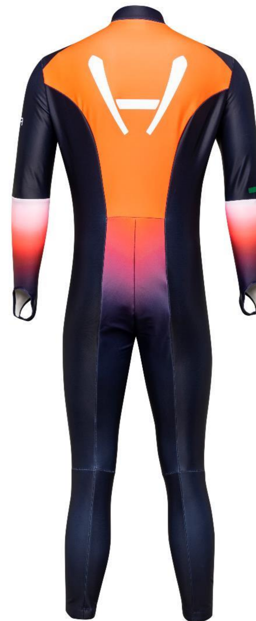
HMR1581 – HJR1585 322-SHOCKING ORANGE/LEAD BLUE/WHITE