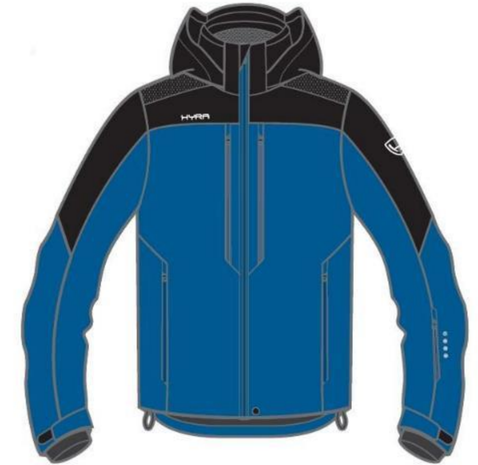
HJG1553 155-BLUE /BLACK