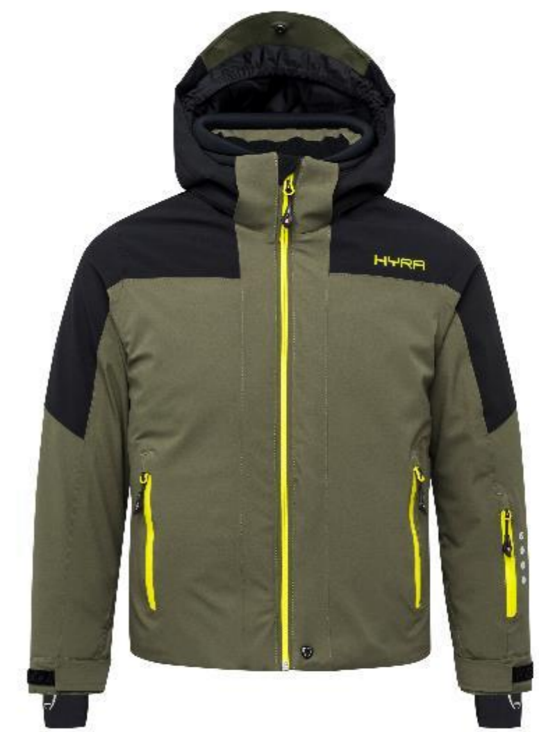
HJG1550 258-ARMY GREEN/BLACK/BLAZING YELLOW