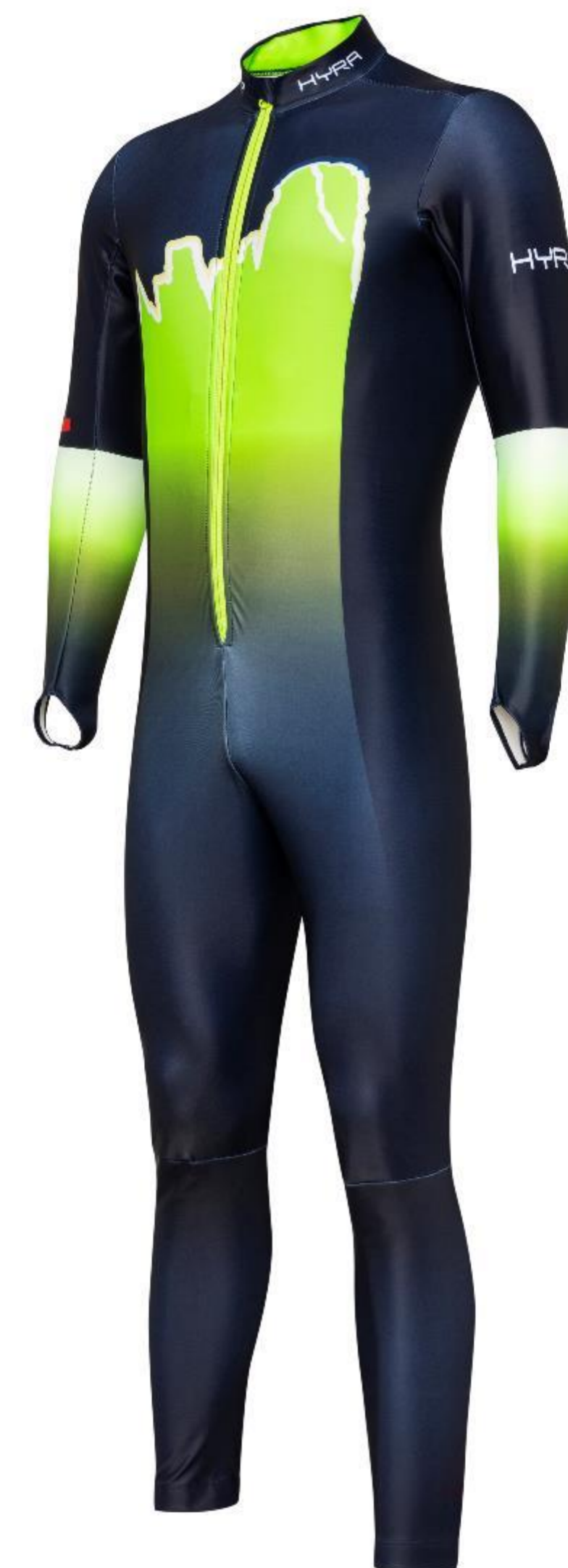
HMR1581 – HJR1585 276-GREEN GEKO/LEAD BLUE/WHITE