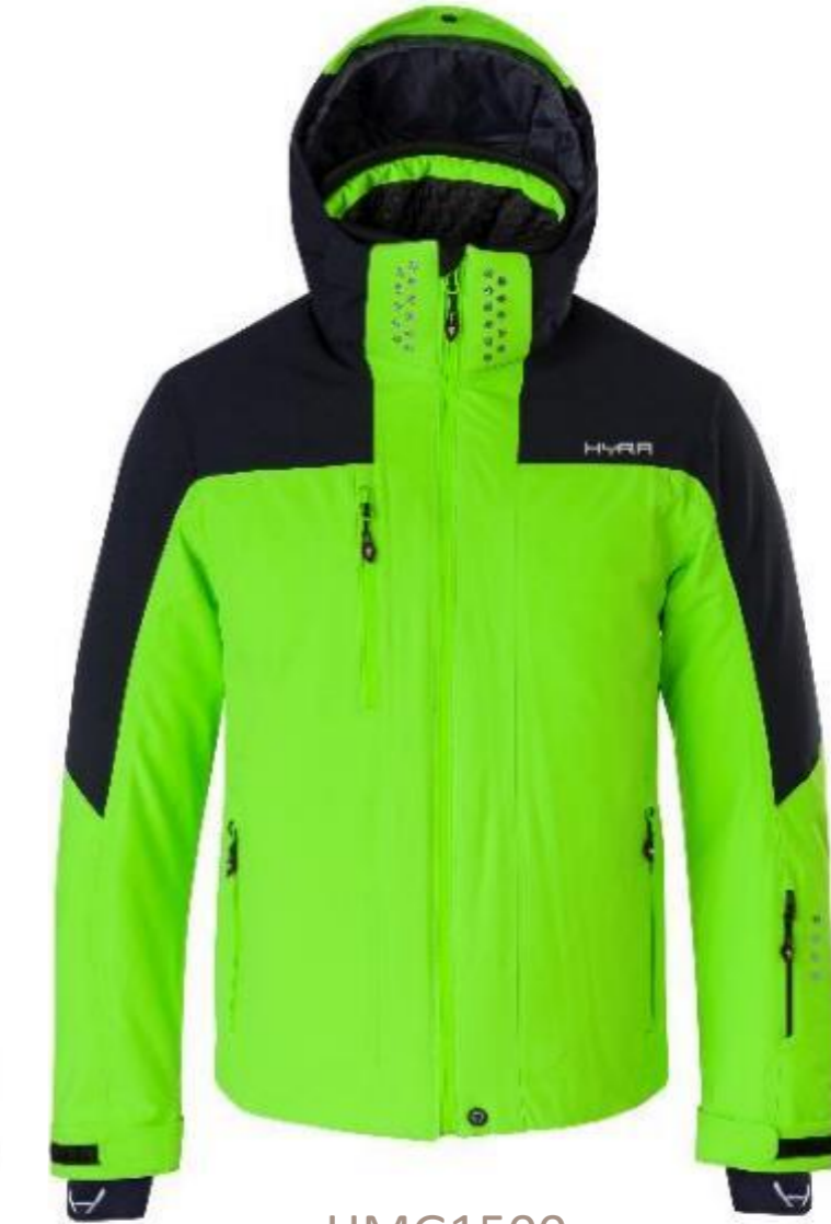
HMG1500 276-GREEN GEKO/LEAD BLUE/WHITE