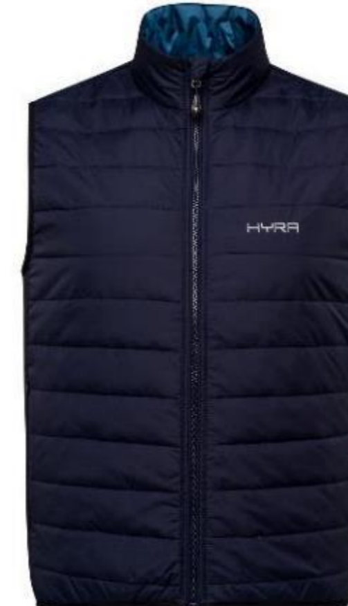
HJG2680 212-LEAD BLUE