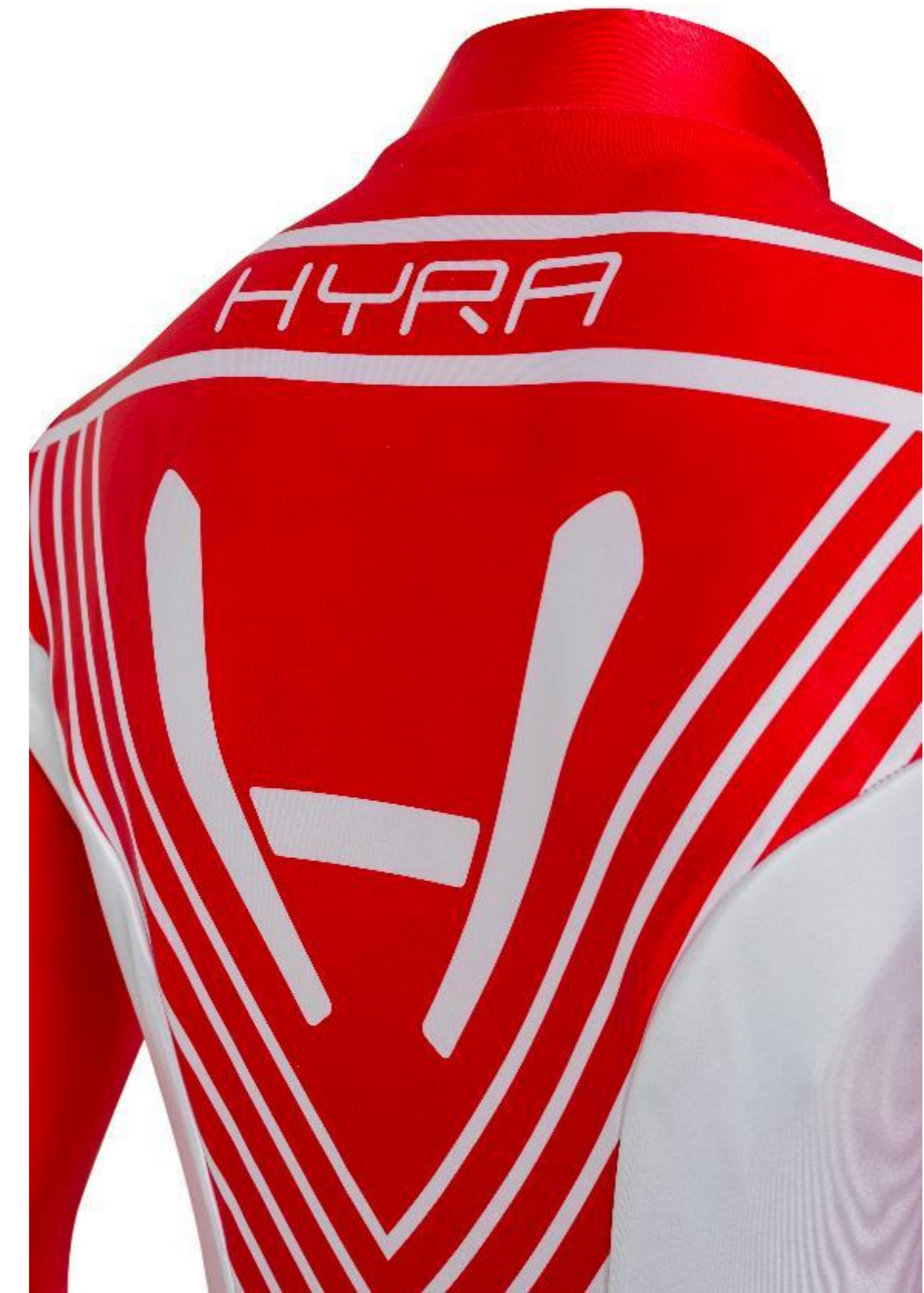
HMR1582 RACE SUIT FIS BIELASTIC