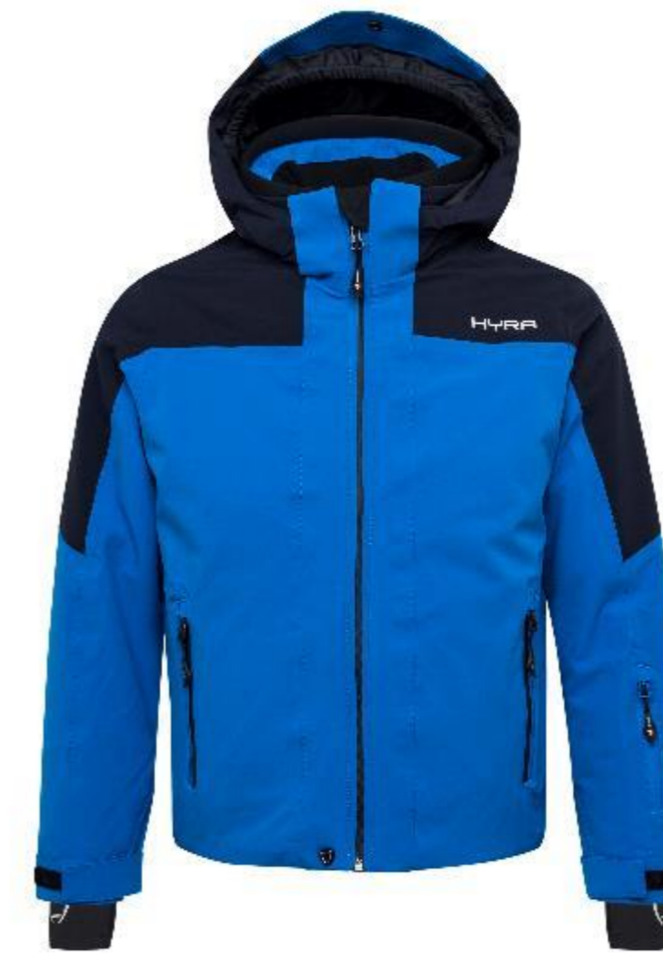
HJG1550 348-BLUE /LEAD BLUE/WHITE