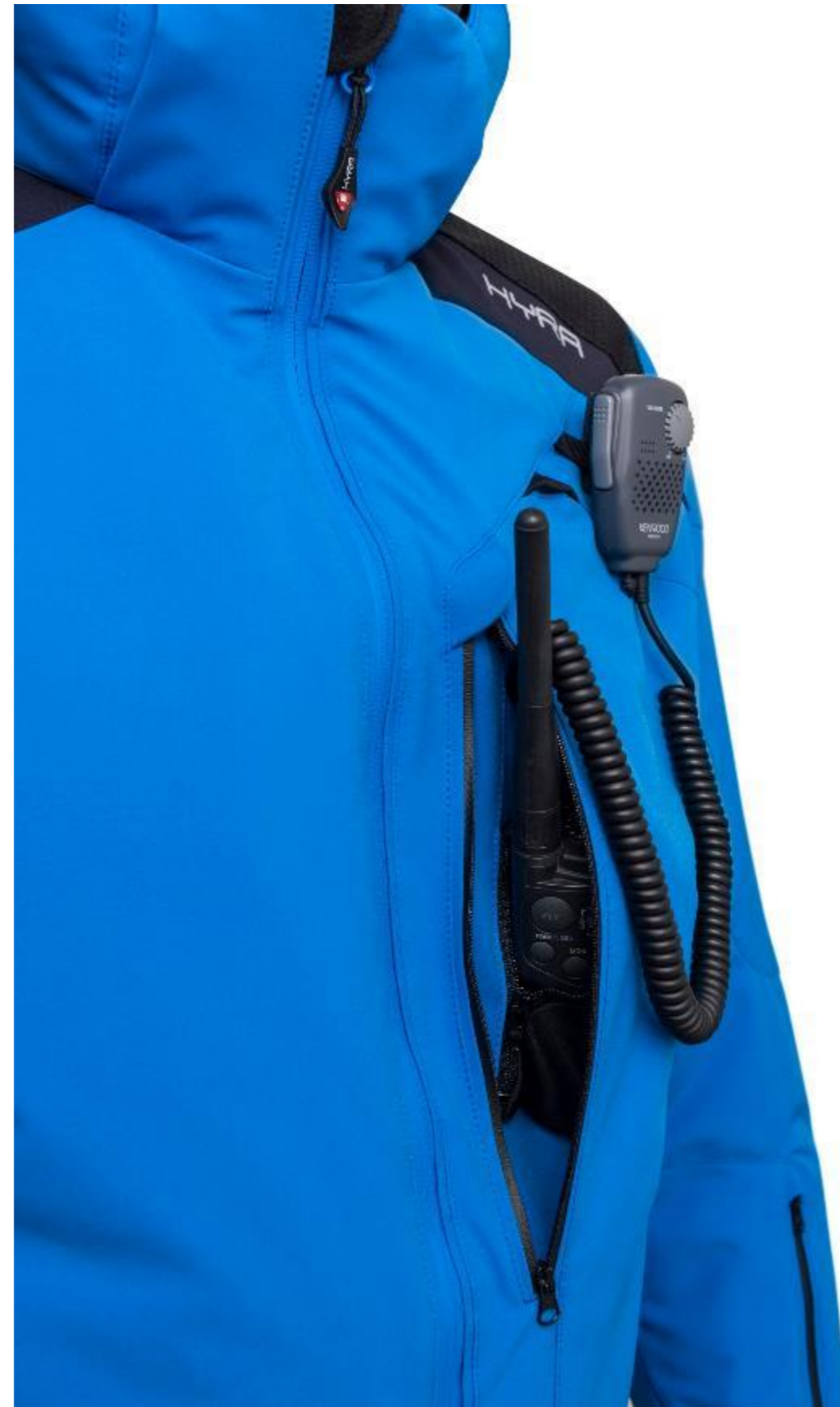
HMG1501 OPENING DETAIL