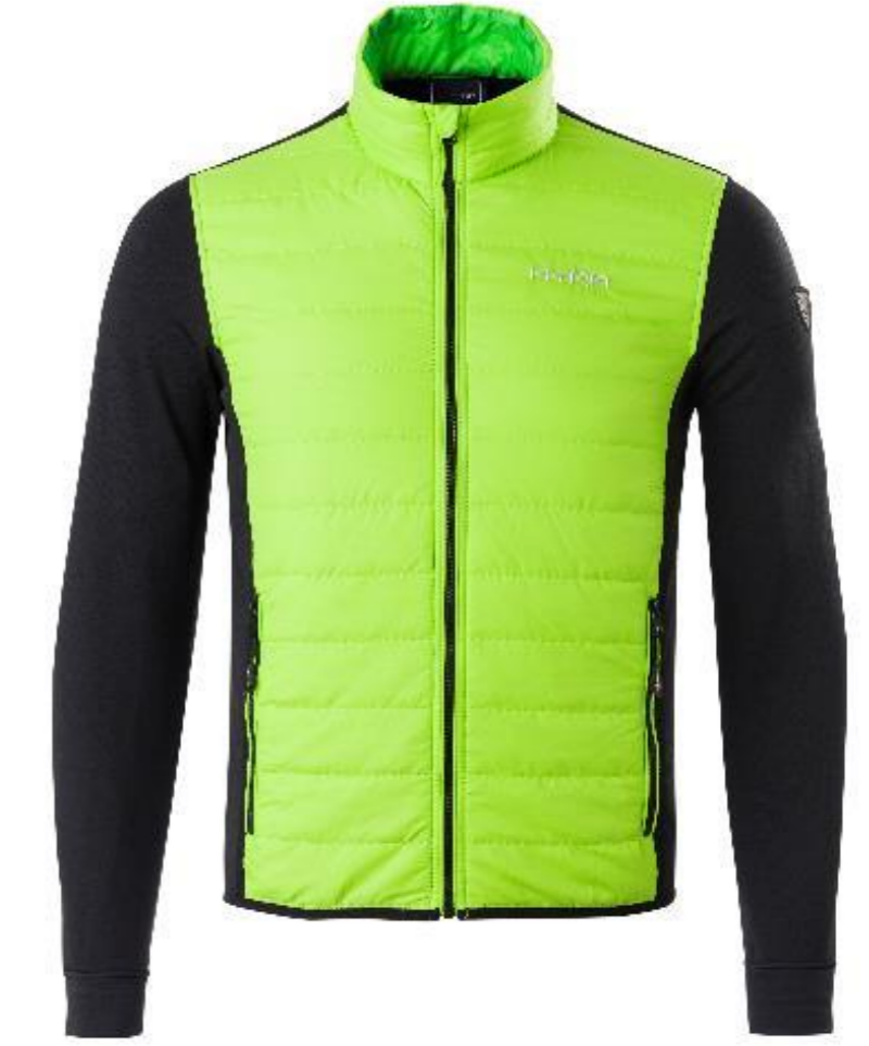
HMG2610 305-LIME GREEN/BLACK