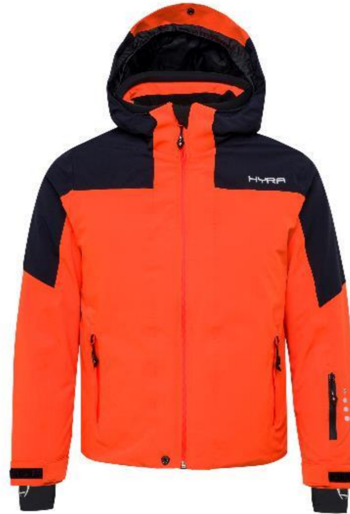
HJG1550 322-SHOCKING ORANGE/LEAD BLUE/WHITE

Soft chin protector Adjustable hem drawstring (inside pocket access) External functional pockets Internal mesh pockets Polybrushed handwarmer pockets Integrated goggle wiper Signature Hyra prints Every detail is engineered to enhance protection, durability and professional-grade alpine performance.