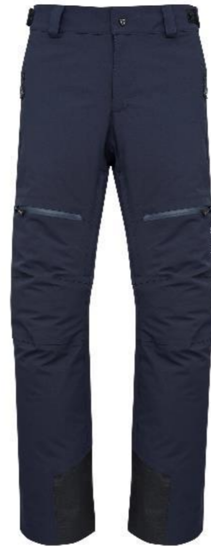
HMP1542 212-LEAD BLUE