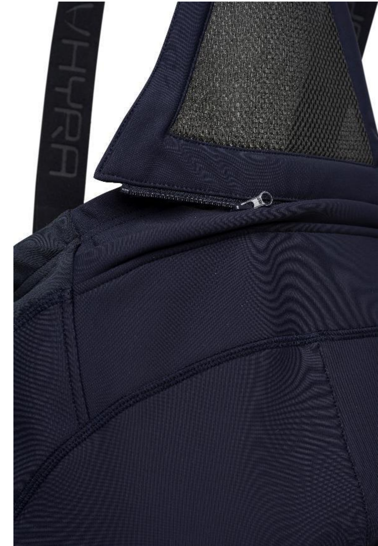
HMP1511 FULL TRASVERSAL ZIP OPENING AT THE BACK