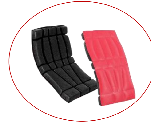
M437484999 Würth Ergopad