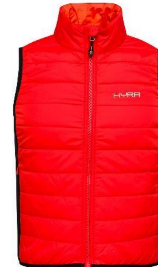
HMG2601 400-HEAT RED