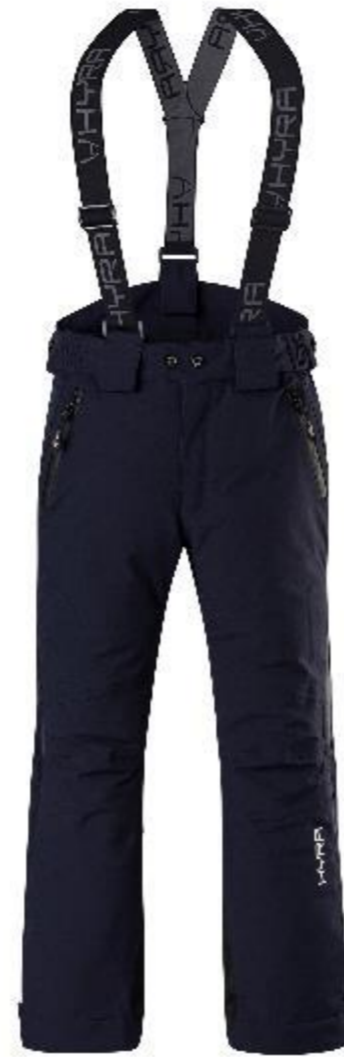
HMP1510 212-LEAD BLUE

Functional pockets Practical access during activity Secure waterproof closures