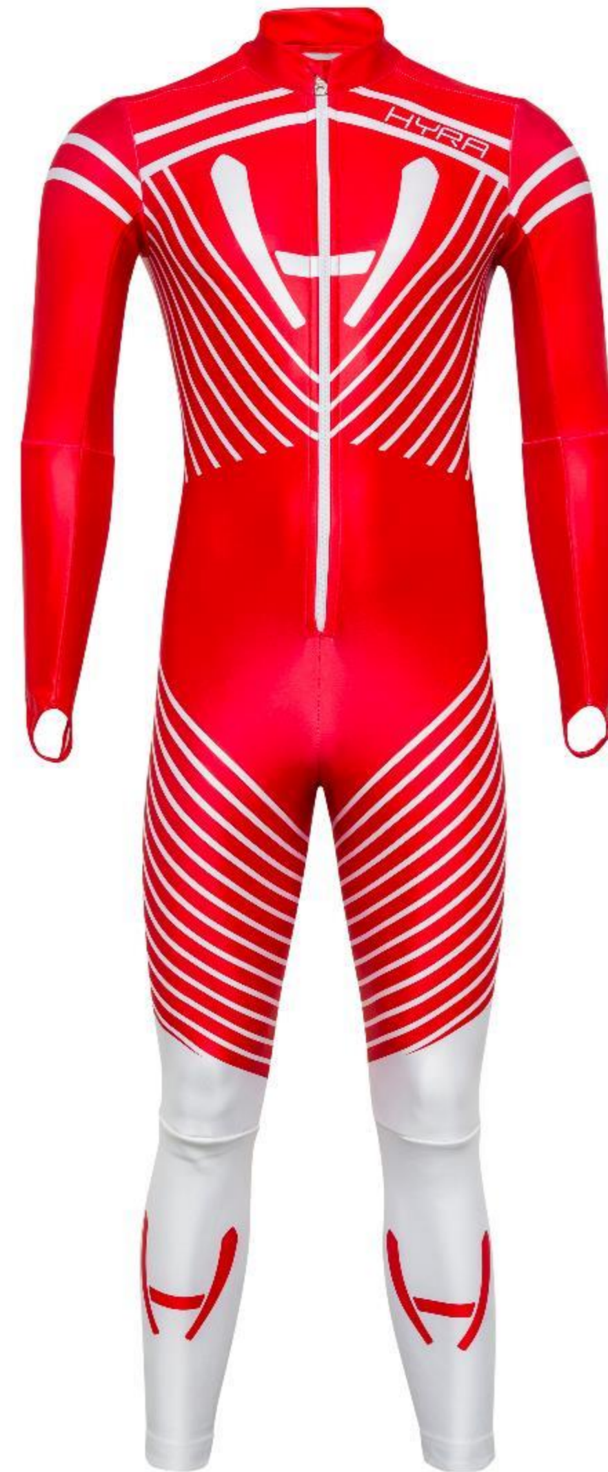
HMR1582 – HJR1586 17-RED

Precision cut to enhance aerodynamics and muscle alignment.