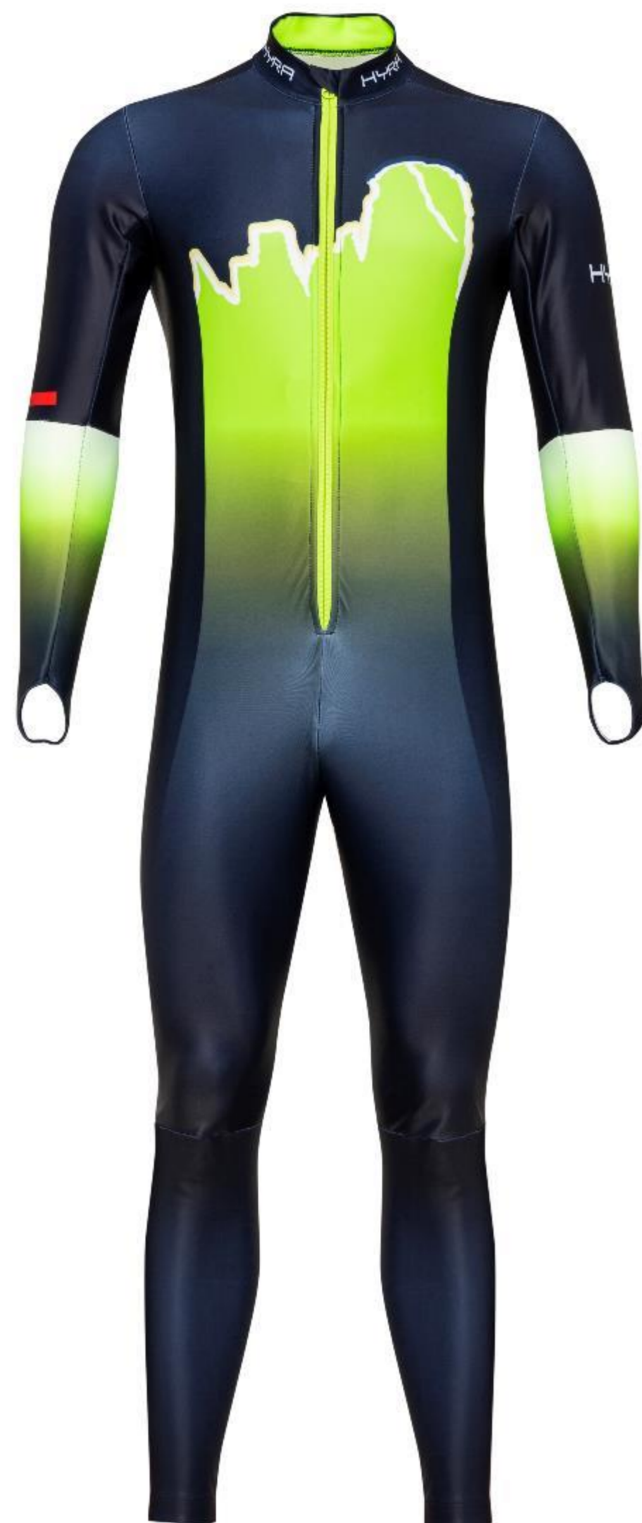
HMR1581 – HJR1585 276-GREEN GEKO/LEAD BLUE/WHITE

Developed for race teams and competitive athlete